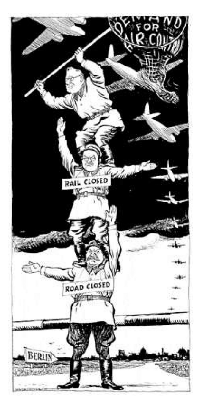
A cartoon published in Britain, September 1948. It shows Stalin and other Soviet leaders.