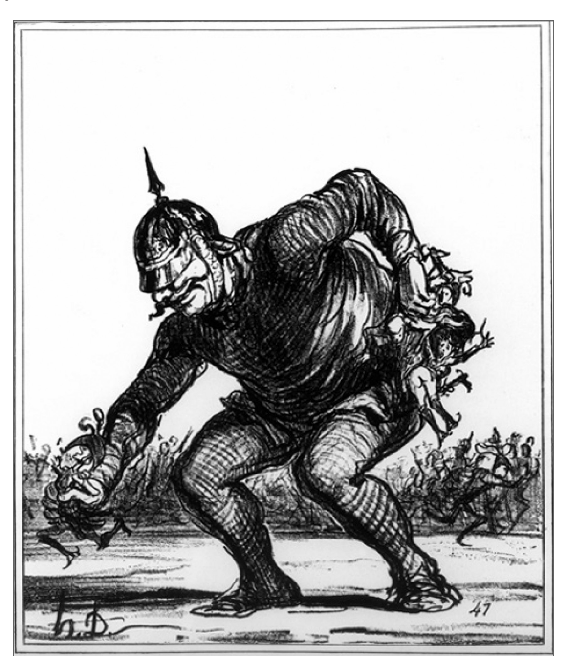
A cartoon published in France in 1866. The states being picked up include Hanover, Hesse-Cassel, Nassau, Schleswig and Holstein.