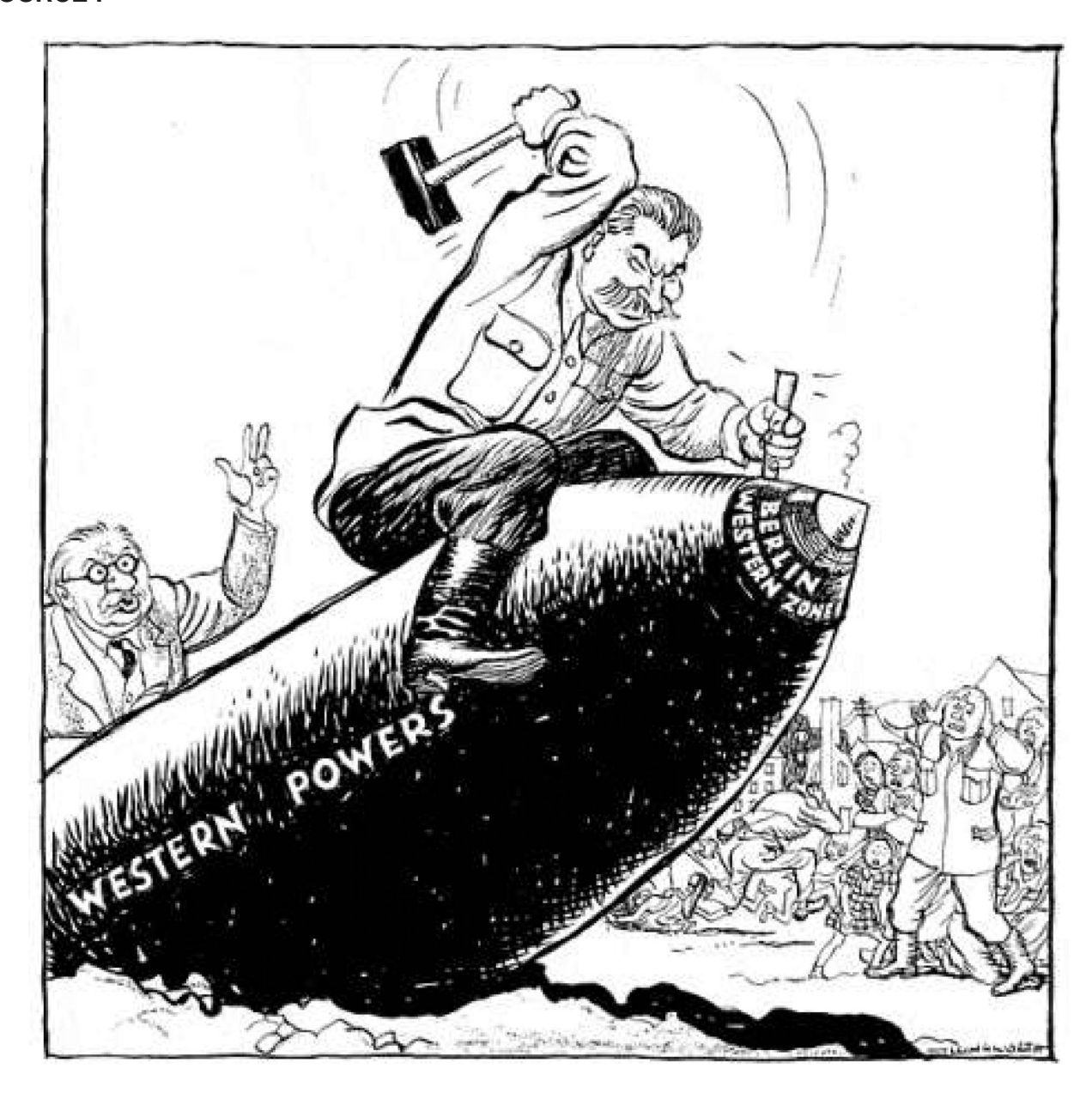
A cartoon published in Britain, June 1948. The figure on the left is Ernest Bevin, who was in charge of British foreign policy at the time.